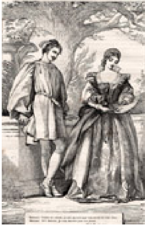
BENEDICT AND BEATRICE FROM “MUCH ADO ABOUT NOTHING”

“Such a February face,/So full of frost, of storm and cloudiness”.