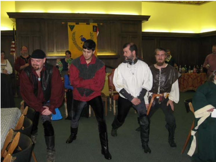
The “Men in Tights” contest from Shire 12 th Night.