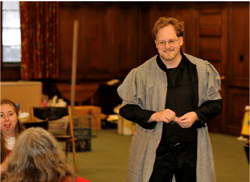
L to R: Lady Thora Winebane, Lady Cigfran Caer Gwalch (back to camera), Lord William the White.