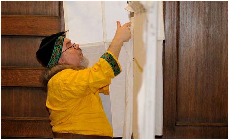
Der Puppenmeister assembles the castle stage for a performance of “The Ogre’s Staircase”, a Japanese folk tale.