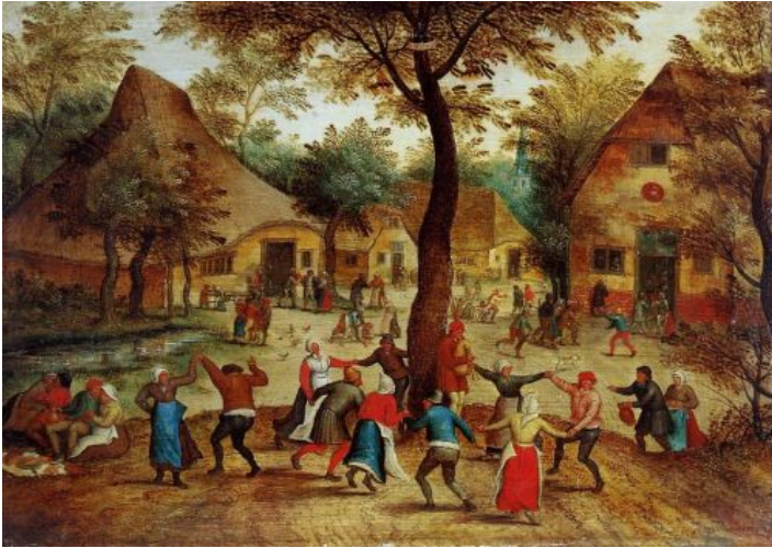
Village Scene with Dance around the May Pole Pieter Bruegel the Younger (1634) Tiroler Landesmuseum in Innsbruck, Switzerland.