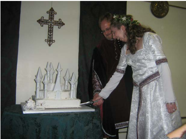
Cutting the Wedding Cake