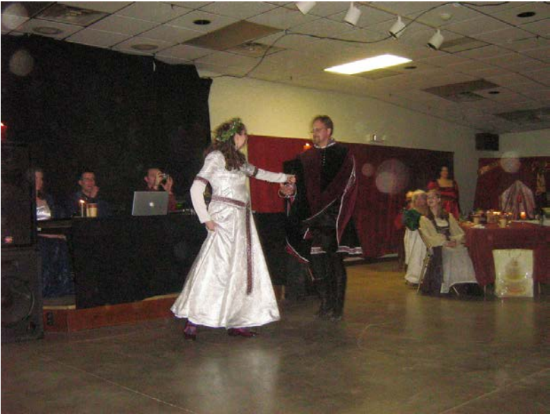
First Dance as Husband and Wife