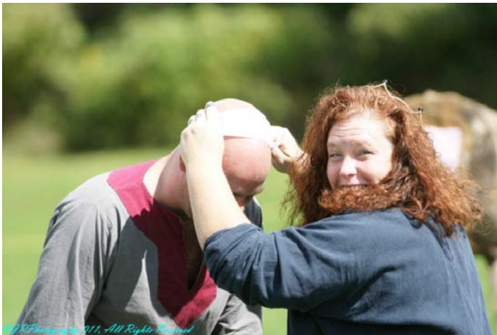
The Queen's handmaiden applies sun block and buffs the TW Champion on orders from the Queen.