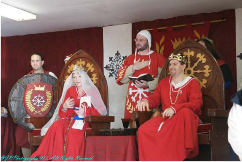
ROYAL COURT AT HARVEST RAID