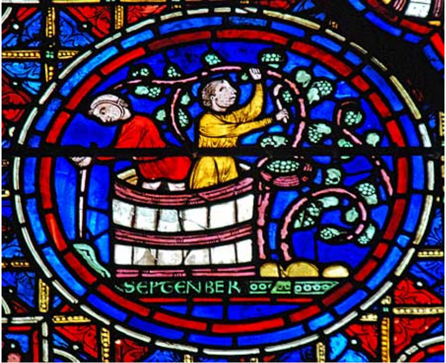
the zodiac window for September

Stained glass from Chartres Cathedral, Chartres France